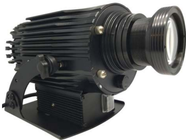
GoboProjektor GoboPro GBP-4004 Power 40 W.