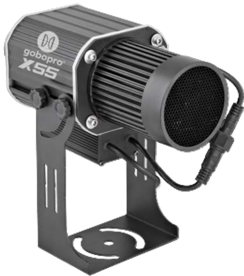
GoboProjektor GoboPro X-55 Power 55 W.