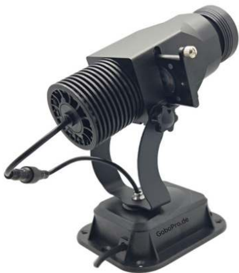
GoboProjektor GoboPro GBP-1501 Power 15 W.