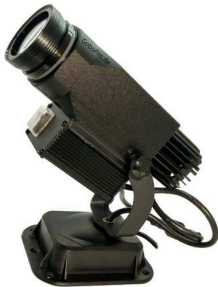
GoboProjektor GoboPro GBP-3001 Power 30 W.